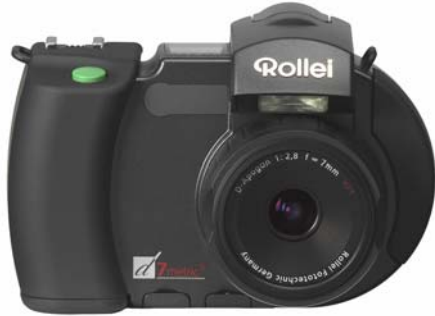
Figure 2. Rollei d7 metric 5

A Rollei d7 metric 5 was used for digital image acquisition. This 5 megapixel camera (2552 x 1920 pixel with approx. 3.5 \mu\text{m} pixel spacing; Fig. 2) provides some features of a metric camera such as a fixfocus lens (7 mm nominal focal length) and a rigid connection between lens and CCD sensor. The camera geometry can be assumed stable during a series of images (Peipe & Stephani, 2003).