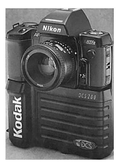
FIG. 2. Kodak DCS200 still video camera.

laptop with 486 processor, a Kodak DCS200 still video camera and the DPA-Win software packages for image preprocessing, image measurement and data management, and CAP (Hinsken et al. , 1992) for bundle triangulation. DPA-Win is a special version of the DPA software running under the Microsoft Windows user interface. The derived data can be interfaced to CAD or quality control systems.