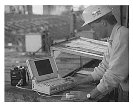
FIG. 1. Kodak DCS200 digital camera connected to a laptop computer for on site data processing.