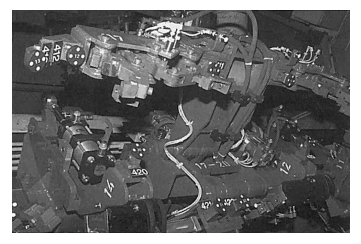
FIG. 4. Digital image of the targeted production tool.

In a measurement volume of 3500 \times 600 \times 1500 mm, the position and rotation of 30 brackets, each signalized with four targets, have to be determined. Due to the extremely confined environment (for example, the distance between camera and object was less than 1000 mm), an image block of 40 bundles was recorded to cover the whole object sufficiently (Fig. 4). The image measurement and bundle triangulation resulted in an image accuracy of 0.41 \mu m and an object accuracy of 0.05 mm in the X and Y directions and 0.04 mm in the Z direction, that is a relative object accuracy of 1:70 000.