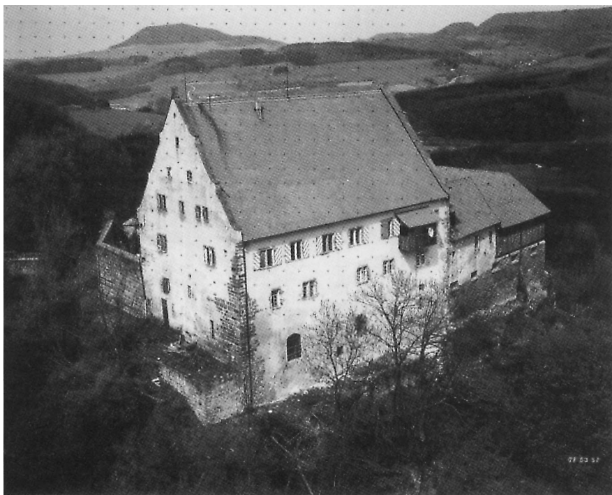
FIG. 1. Ramsberg Castle from the helicopter. The photograph was taken with a Linhof Metrika.