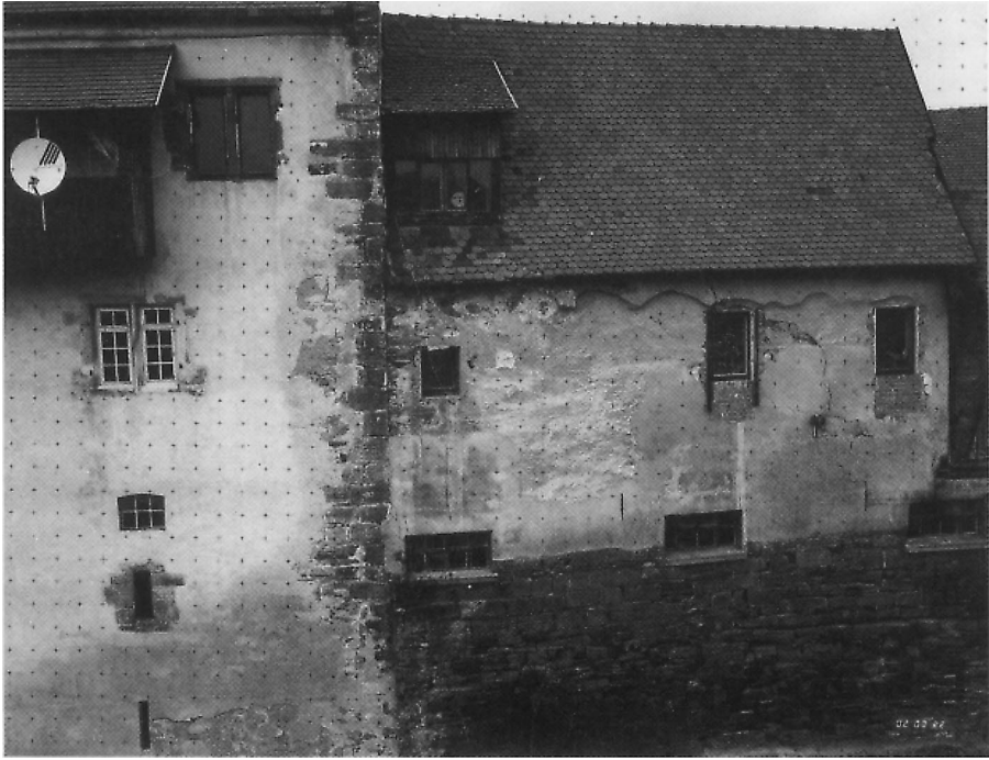
FIG. 4. A photograph of a part of the south-east façade of Ramsberg Castle.

(Fig. 1). (The camera used had a very dense réseau grid of 2.5 mm spacing required for special applications in industrial metrology but not necessary, of course, for the photogrammetric survey of the castle.)