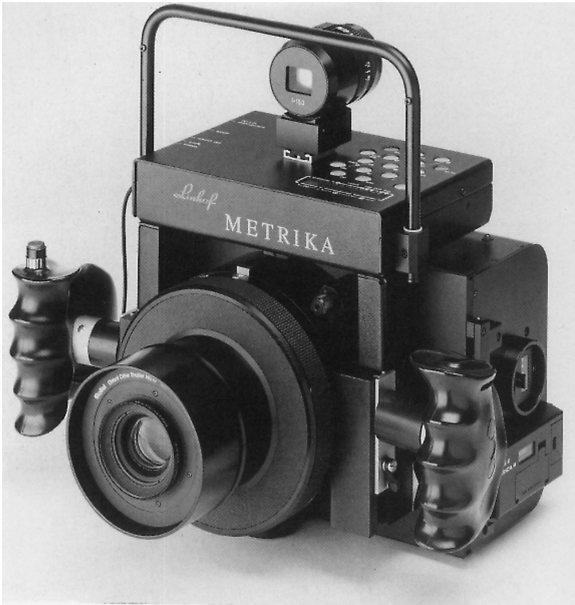
FIG. 3. A Linhof Metrika with 150 mm lens.

Three lens systems are available: 75 mm and 90 mm Schneider Super Angulon wide angle lenses and 150 mm Schneider Apo Symmar normal angle lens. The focusing mount of each lens is equipped with a number of click stops. Each focusing stop defines a set of interior orientation parameters which remain stable once determined by camera calibration (Peipe, 1990).