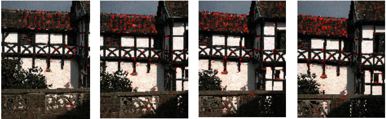
Figure 4. The first four images of a sequence taken with the Rollei d30 metric 5 camera and the points tracked through it.