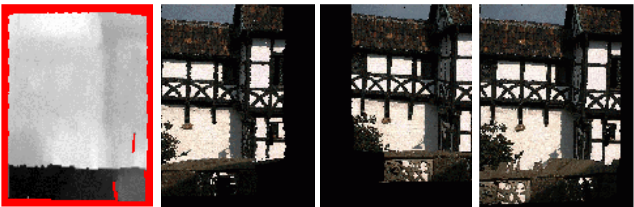
Figure 7: Disparity map (left) and visualizations based on the disparity map

Our approach for the computation of 3D structure (Mayer, 2003), i.e., a disparity image in the first place, from an image pair or triplet is based on the algorithm for cooperative disparity estimation proposed in Zitnick and Kanade (2000). The respective image pair is resampled along the epipolar lines. Matching scores are computed by cross correlation and absolute differences and written in a 3D array made up of image width, height, and disparity range. As the computational effort depends directly on the range of the disparity, we compute this range by projecting the points reliably determined for the image triplet onto the epipolar lines.