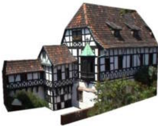
Figure 3. Wartburg Castle: Part of the first courtyard

A subset of 10 Rollei images covering a part of the first courtyard was selected to compare the 3-D reconstruction process normally used in close-range photogrammetry with methods preferably applied in computer vision. The digital images were taken parallel to the object facade having relatively short distances between the camera positions. Image data were obtained by manual pointwise measurement within the AICON DPA-Pro and PhotoModeler software. Then, interior and exterior orientation parameters as well as 3-D coordinates of object points were determined by self-calibrating bundle adjustment. Fig. 3 shows the result of the visualization of this part of the castle.