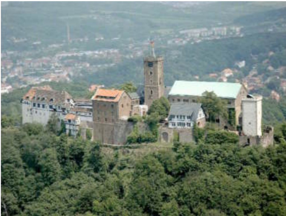
Figure 1. Wartburg Castle

famous for being the place Martin Luther translated the New Testament into the German language about 1520, and important as meeting-place and symbol for students and other young people being in opposition to feudalism at 1820. Nowadays, this monument full of historical reminiscences is a significant cultural heritage landmark and, obviously, a touristic centre of attraction.