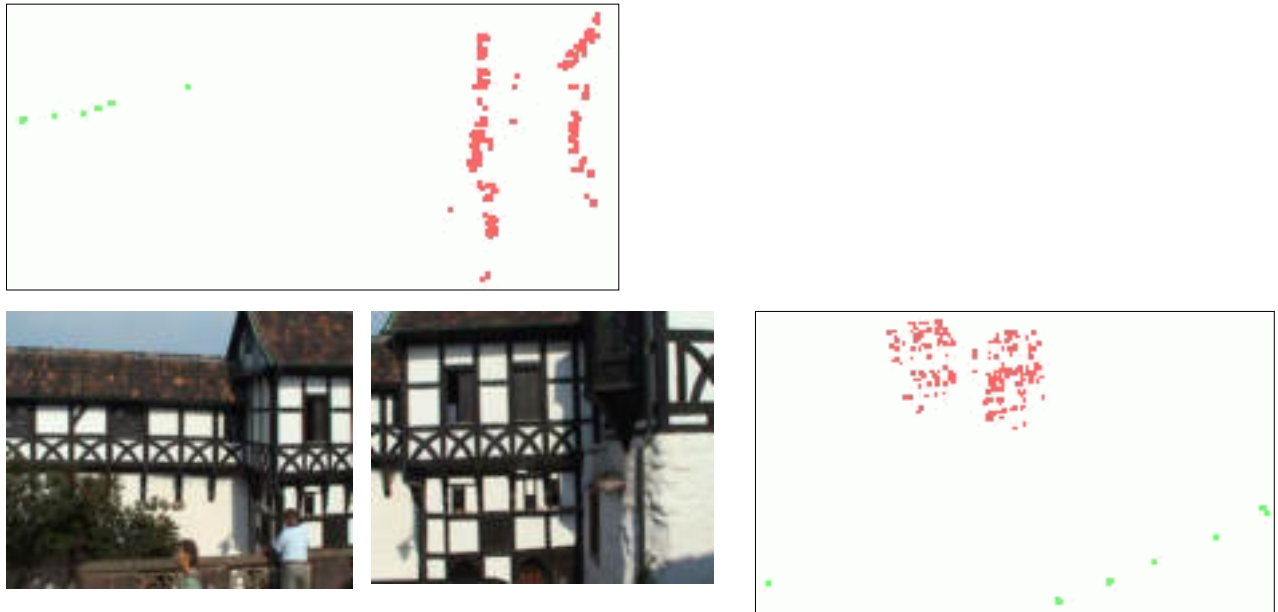
Figure 6. First and last image of an image sequence taken with the Sony camcorder (left below) and two views of the VRML model fully automatically generated from the sequence (top and right).

Figure 6 shows the first and the last image of a sequence taken with the Sony camcorder and two views of the resulting VRML model. Of the 1500 images we have taken only seven to minimize the computational effort. Overall, we obtained 71 7-fold, 60 6-fold, 55 5-fold 24 4-fold, and 4 3-fold points after robust adjustment and an error of 0.06 pixels. For this camera only the range of the focal length is known, but not the pixel size or the metric size of the sensor, i.e., the parameters of the camera matrix are unknown. Our auto-calibration scheme resulted into 1.66 for the ratio of principal distance to image width and 2.38 for the ratio of principal distance to image height. The precision in image space was 0.25 pixels. It should be noted that the results have been obtained without user interaction and with the same set of parameters as for the above sequence. The two views of the VRML model generated for the points and the cameras shows that the metric geometry of the scene has been recovered fairly well.