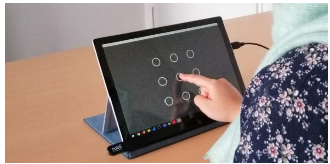
Figure 1: Study setup where we investigate the difference between using gaze and touch for entering lock patterns

© 2020 Association for Computing Machinery. ACM ISBN 978-1-4503-7134-6/20/06...$15.00 https://doi.org/10.1145/3379156.3391371