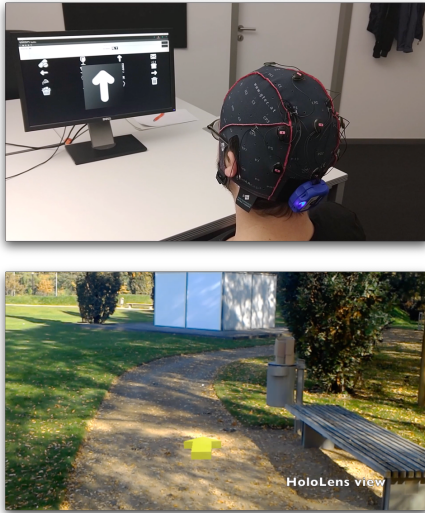
Figure 3: A static person operating the P300 interface to communicate navigational directions with the proxy through augmented reality glasses (i.e., HoloLens).