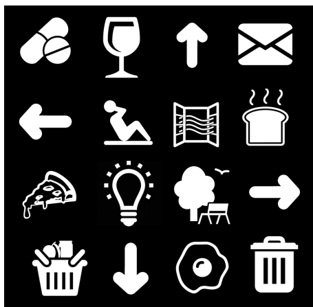
Figure 2: The grid of the P300 speller that is shown to the LIS patient.

On the proxy side, we used AR glasses to display selected items. We implemented our application for the Microsoft HoloLens, using the Unity engine as a platform. The speller already integrates a network interface which was used to send the selected elements to the proxy. The application receives the message and is able to display the selected item that is then sent via TCP to the HoloLens application. Those actions are then shown to the proxy in the form of a three-dimensional arrow object or as an icon. This object is displayed in the wearer's field of view for three seconds, every time an element is sent.