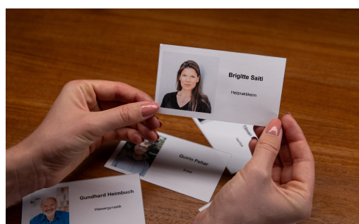
Figure 1: Safe Call consists of physical contact cards and a smartphone app. The NFC-based contact cards allow users to save contacts and call them with a tap. To indicate potential scams, the app adds a warning to incoming calls from unfamiliar callers.