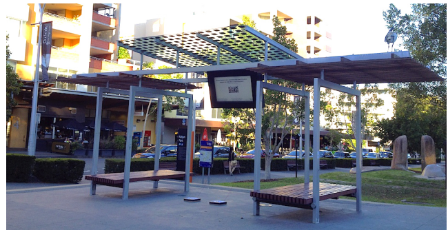
Figure 1: The urban screen used for Vote With Your Feet . We deployed the system at a bus stop in Brisbane, Australia.

PerDis'14 , June 03 - 04 2014, Copenhagen, Denmark Copyright is held by the owner/author(s). Publication rights licensed to ACM. ACM 978-1-4503-2952-1/14/06 ... $15.00. http://dx.doi.org/10.1145/2611009.2611015