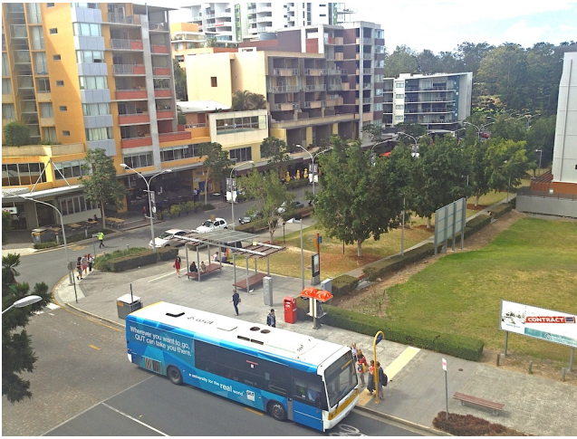
Figure 5: The surroundings of the urban screen.