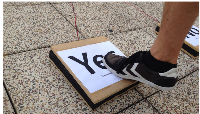
Figure 4: Users participate by stepping on tangible buttons.