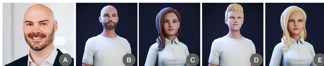
Figure 1. We investigate how different avatar embodiment influences user emotions in VR. We used the participant's photograph by Ready Player Me 1 (a), to generate four types of embodiment: (b) personalized, same-gender avatar based on (a), (c) personalized opposite-gender avatar based on (a), (d) non-personalized, same-gender avatar, and (e) non-personalized opposite-gender avatar.

Keywords: Avatars, Virtual Reality, Emotions, Embodiment