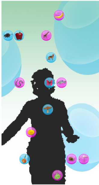
Figure 2: A user is interacting with the soap bubble game.