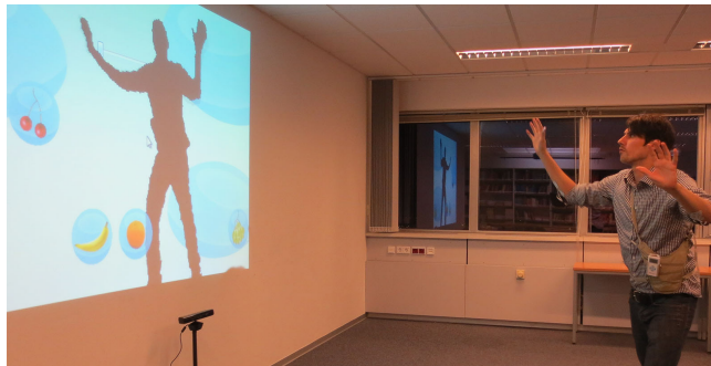
Figure 1: A user is interacting with the system perceiving EMS feedback.

Institute for Visualization and Interactive Systems University of Stuttgart {firstname.lastname}@vis.uni-stuttgart.de