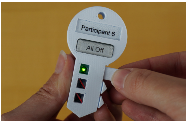
(a) The Wizard-of-Oz tangibles illustrate the envisioned size and portability. The depicted tangible is configured to allow only video recordings. The all off button can be used to turn off all sensors.

Florian Alt University of the Bundeswehr Munich Germany florian.alt@unibw.de