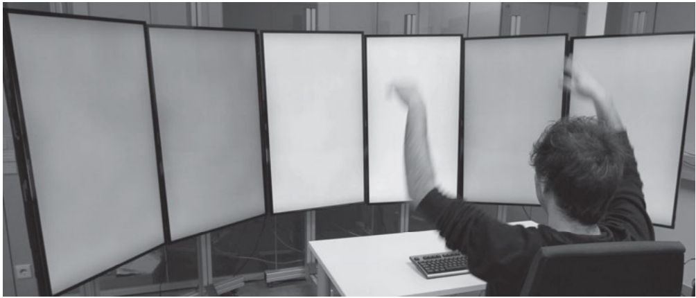
Figure 2: A participant is performing a gesture.

Inspired by Wobbrock (Wobbrock et al. 2009), we conducted a user study to design a gesture set for manipulating application windows. We recruited 10 male and 2 female participants through our mailing lists. In the study, we ask them to perform gestures for a given command set (see Fig. 1). We repeated this for every command and participant three times. For analyzing the performed gestures, we recorded all sessions on video. Through the analysis of the user study, we were able to generate a set of gestures to perform the 14 most common window management tasks e.g. select window, move window or resize. In a second step, we implemented the gesture set as fully working application for Windows 8.1.