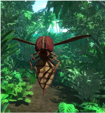
Figure 2: Exemplary VR scene, where users experience a bumblebee.

Quadcopters are enclosed in a cage to protect the user from rotating propeller and to deliver tactile feedback on impact. If a VR scene requires tactile feedback at a particular body position, a single quadcopter accelerates in the direction of the respective body part. When a virtual object hits the user, the physical position of the accelerated quadcopter hits the specific body part. This enables a spatial synchronous representation of tactile, visual, and auditory feedback. Using a quadcopter to provide tactile feedback allows creating different types of feedback by changing the speed, weight, and tips of the quadcopter. For this Interactivity installation, colliding objects are represented as stinging bumblebees, arrows, and hurling particles.