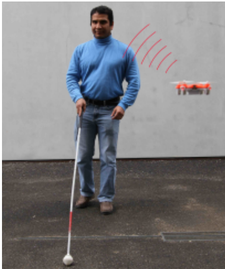
Figure 3: The sound of a drone is capable of guiding visually impaired.

The power potential of the motors limits the payload and can negatively impact the quality of force feedback. This can affect that a user cannot feel the drone dragging their hand [6] or that the level of resistance the drone can provide is not enough to stop the pushing of the users' hand [5].