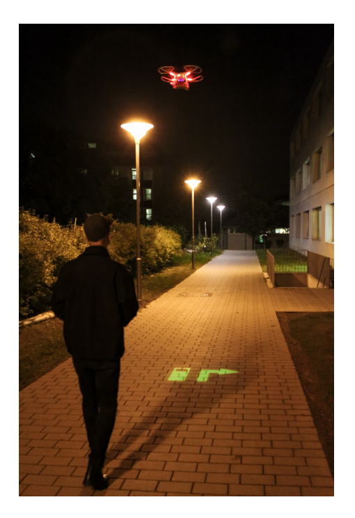
Figure 2: A pedestrian receives navigational instructions by a projector attached to a drone.

attached actuator to nudge the users and therefore simulate feedback for bumblebees, arrows, and other objects hitting the user, while the user is visually and acoustically immersed in VR.