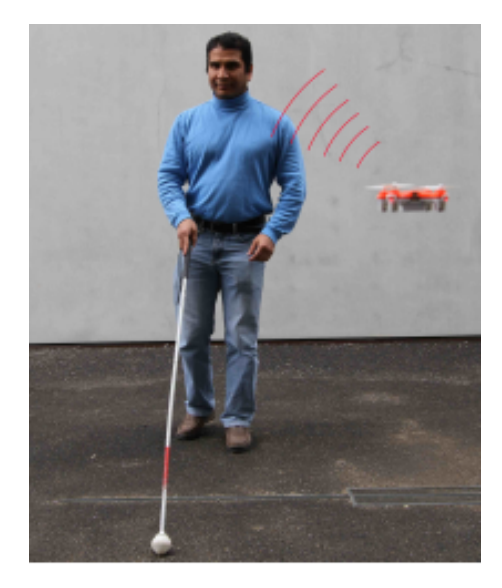
Figure 3: The sound of a drone is capable of guiding visually impaired.

The power potential of the motors limits the payload and can negatively impact the quality of force feedback. This can affect that a user cannot feel the drone dragging their hand [6] or that the level of resistance the drone can provide is not enough to stop the pushing of the users' hand [5].