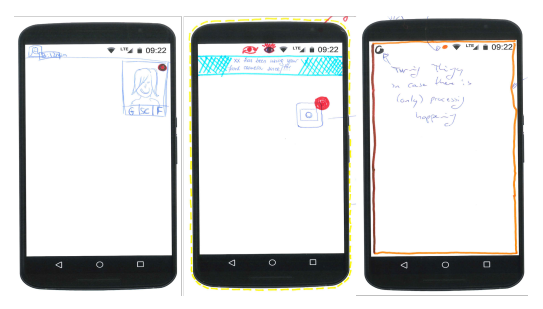
Figure 1: Three designs from our focus group: Camera feed on top corner with a red recording dot and the apps using it (left); floating camera icon with red recording dot and notification bar with app name (middle); and Red/Orange frame showing camera access/processing (right).

Mohamed Khamis mohamed.khamis@glasgow.ac.uk University of Glasgow Glasgow, United Kingdom