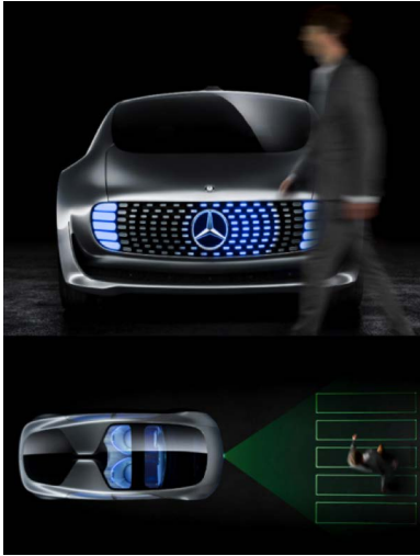
Figure 4: The Mercedes F105 concept vehicle includes illuminated and projected displays for pedestrians. [17]