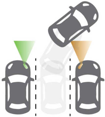
Figure 2: Adjacent cars providing parking guidance (green and orange lights) when reversing into a parking space.