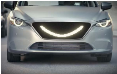
Figure 5: The Semcon smiling car concept. [16]