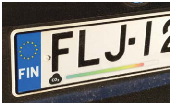
Figure 3: A dynamic air pollution display included in the license plate, to raise social awareness of fuel economy and air pollution issues. In the case of shared (electric) vehicles, the same area could be utilized to display battery charge status or fuel level.

displays, and other ubiquitous computing systems being integrated in cars. In the area of human-computer interaction (HCI), research has addressed topics such as car dashboard design [1], different input methods for in-car touch screens [2], persuasive UI design for more economic driving behavior [11], and haptic feedback for interaction [6,14], to name a few. Despite the vast amount of car related interaction research, current HCI design scarcely considers cars in senses other than as transport. In this paper, we approach cars from the viewpoint of their outward appearance, and consider the possibilities to use them as platforms for external displays. With display technologies developing towards arbitrary shapes, and different forms of public displays integrating in the urban spaces [8], it is timely to consider car surfaces also from this aspect (see Figure 1). As examples, the following use cases introduce potential applications within the scope of the car external display space