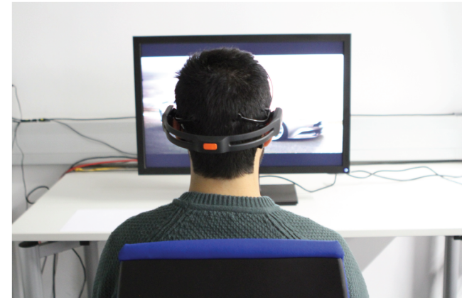
Figure 2: Participant viewing pictures in stationary setup

We used a repeated measures design with two levels of feedback for engagement in the shown topic: implicitly using the EPOC and explicitly by asking users about their interest level in the displayed image using a 7-point likert scale. Participants were seated in a controlled environment and fitted with the EPOC 2. To have a baseline for comparison of EEG signals, we first recorded 60 seconds of