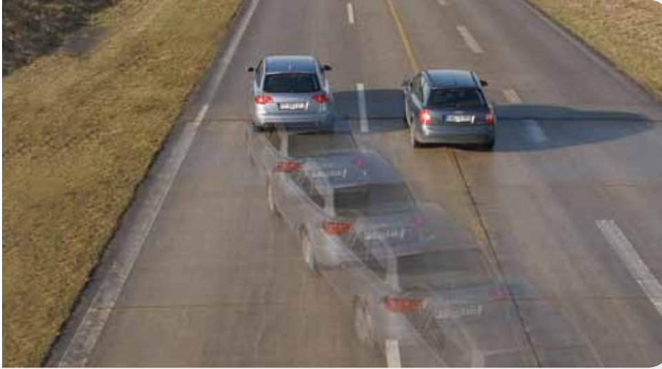
Individual Traffic of Tomorrow