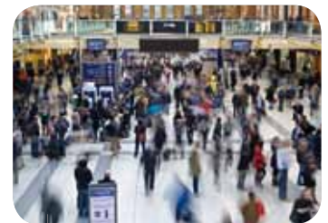
RISK – Risk, Infrastructure, Security and Conflict