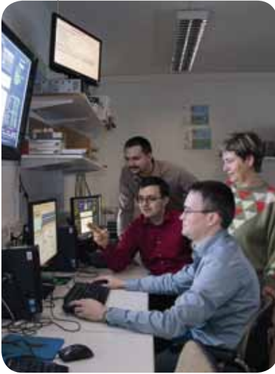
Monitoring the IT security of networked systems