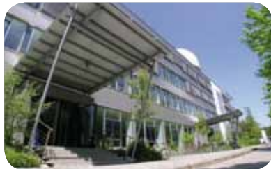
The Bundeswehr University Munich offers a wide range of research programs and options

It focuses on the academic education of young officers in a trimester system. The ideal framework conditions of a campus university with an outstanding infrastructure offer a broad range of working and cooperation facilities notably in research. Due to the excellent trans-faculty cooperation in automobile, security and aerospace research, the Bundeswehr University Munich is recognized and plays a leading role in these fields also in international research.