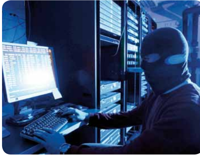
Security breaches in the virtual world