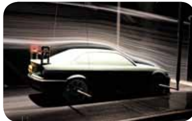
Excellent scientific infrastructure allows for cutting-edge research