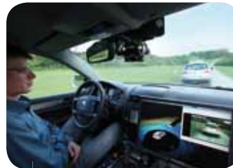
MOVE – Modern Vehicles