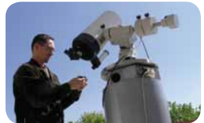
The University participates in numerous international projects such as "Galileo"