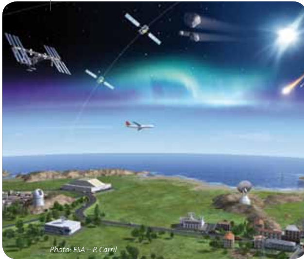
Communication & Navigation