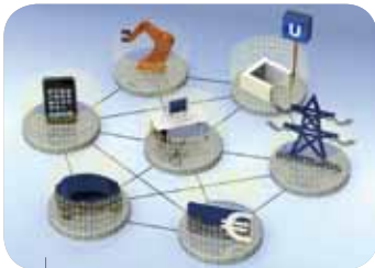
CODE – Cyber Defence

The common goal of the Research Centers is to make the research strengths of the University visible and position them in the national and international research landscape. Further goals varying from Research Center to Research Center are, among others, the promotion of young scientists, user consultancy as well as the establishment and extension of external research cooperation programs.