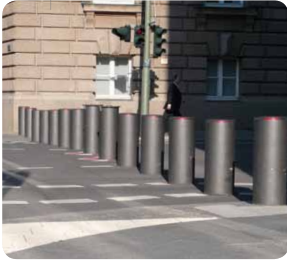
Road Barriers: Freedom vs Security