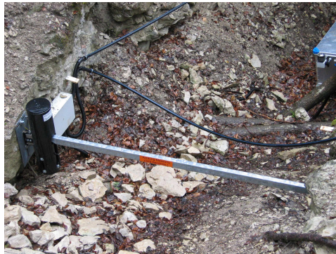
Figure 2. Extensometer monitoring ditch expansion

Within the current project a landslide application has been selected as a basis for evaluating the concepts of a sophisticated mobile data acquisition client (Plan et.al., 2004, Kandawasvika, et. al 2004). Two test areas have been selected for practical tests: Balingen and Rosenheim, Germany. These areas are very landslide active and it is being suspected that at any time rapid debris avalanches might occur, resulting in undesirable natural hazard. For this reason, continuous monitoring of these areas is vital. In order to achieve this, some sensors have been installed permanently in the field. Currently, there are a number of extensometers observing the inevitable seasonal expansions and contractions of the ditches ( ger.: Spalten ). Figure 2 shows an example of a geological object (i.e. ditch), in Balingen area, being monitored by an extensometer for any change in gap expansion. The extensometer's daily measurements are send regularly to a geological office for evaluation. As mentioned before, if a certain threshold is reached or exceeded, an alarm is generated, in this case, in form of a short messaging service (SMS) and the roads near-by landslide active area are closed. This avoids any danger to motorists or people on foot.