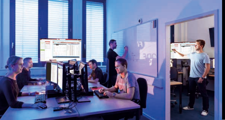
Teamwork takes the center stage: The trainees analyze and mitigate incidents together as a team.