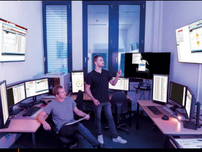
Our trainers monitor the team progress, manage scenarios and enable a unique learning experience.

RI CODE's Cyber Range has two fully equipped classrooms for teams with up to six trainees.